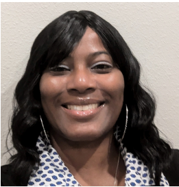
Admin Specialist II