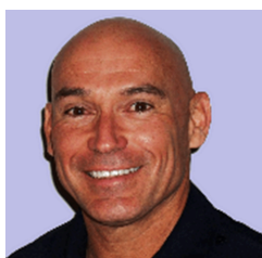
Board Vice- Chair